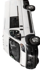
PROMASTER 159" EXT. CREW