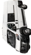
PROMASTER 136" CREW