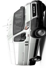
PROMASTER 159" EXT.

NOTE: FLOOR PART NUMBERS ABOVE COME WITH ALUMINIUM SIDE AND REAR SILLS. FLOORS WITHOUT SILLS CAN BE ORDERED TO ACCOMMODATE STEEL THRESHOLDS.