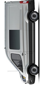
TRANSIT 148" EXT. CREW