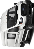
TRANSIT 148" CREW