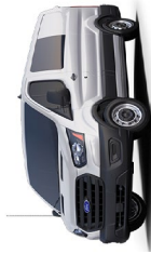
TRANSIT 130" CREW